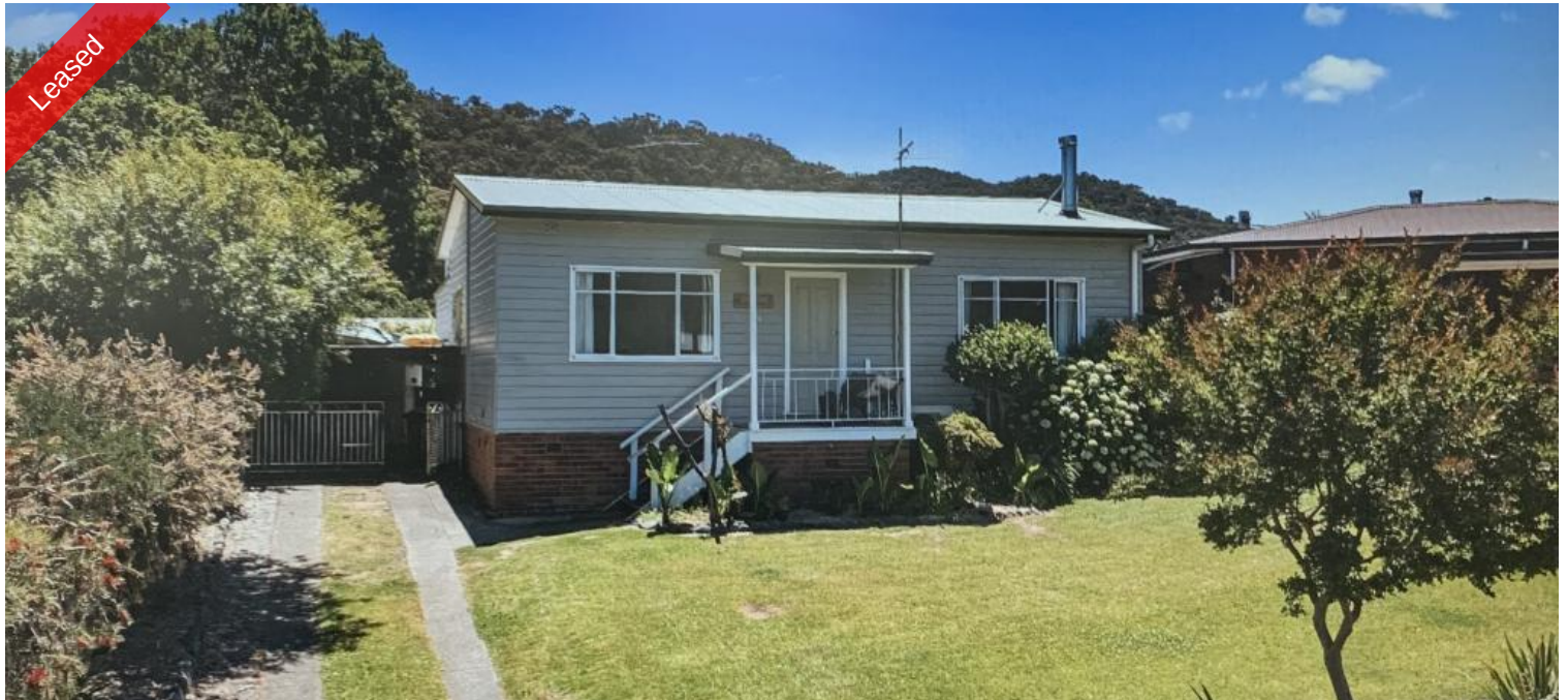
23 Mitchell Ave, Khancoban