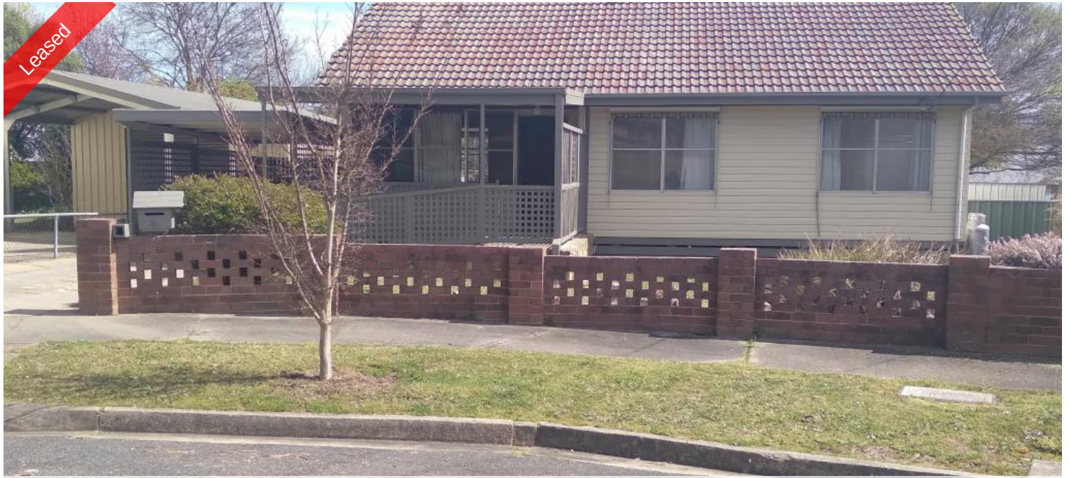
4 Mitchell Ct, Corryong