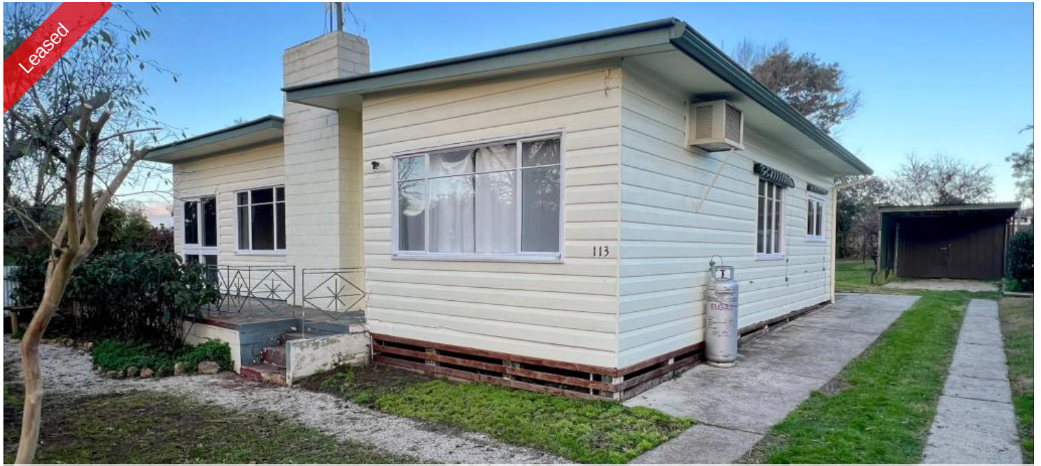
113 Towong Rd, Corryong