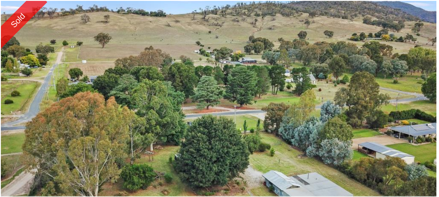
5 Brooke St, Towong