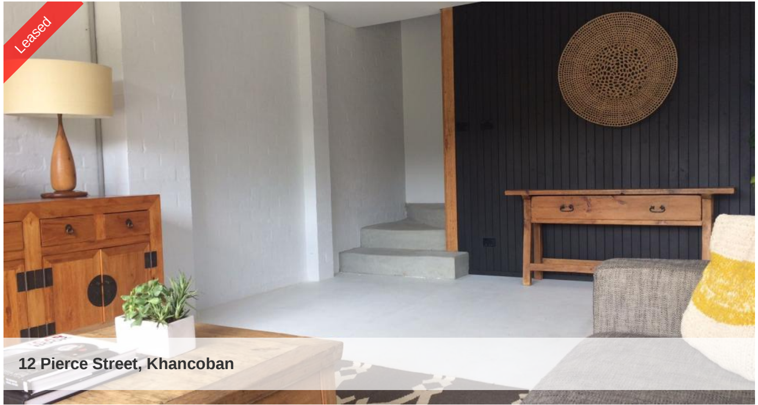
12 Pierce Street, Khancoban