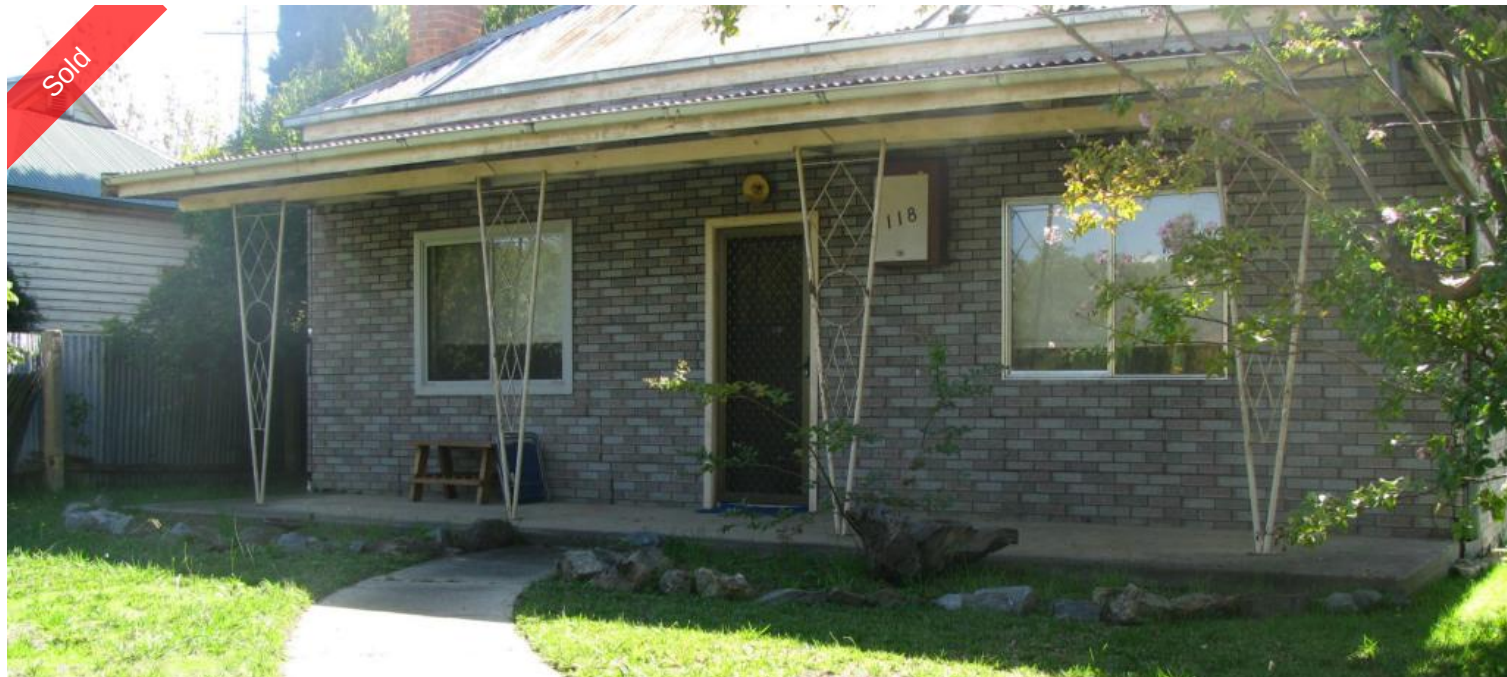
118 Hansen Street, Corryong