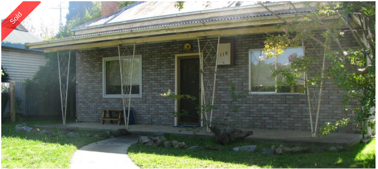
118 Hansen Street, Corryong