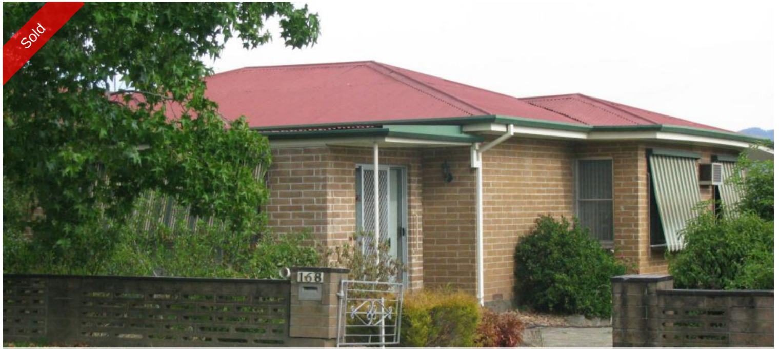
168 Hansen Street, Corryong